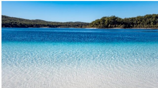
Lake McKenzie - Fraser Island

In July 2020 the Covid-19 Pandemic was spreading across the world. Prior to a second wave in Victoria, Australia had been successful in keeping cases low and state borders were beginning to re-open. Queensland was due to open its border to NSW on July 10th and we headed north from Sydney with a view to enjoying some winter Queensland sunshine. As it turned out the borders were opened as scheduled, but closed again to Sydneysiders on August 1st. This is a record of our trip.