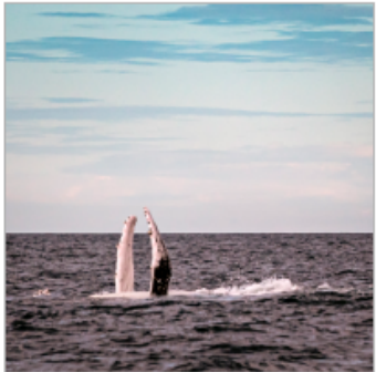
Whale watching - Jetty Dive Boat off Coffs Harbour