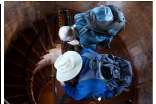
PHOTO GALLERY - UPGRADE TO VERSION 2 SOFTWARE

The Photo Gallery uses the popular open source web based photo album organiser software called Gallery . We are currently running Version 1 of the software and have been reluctant to upgrade to the current Version 2 because it has limitations with permissions.