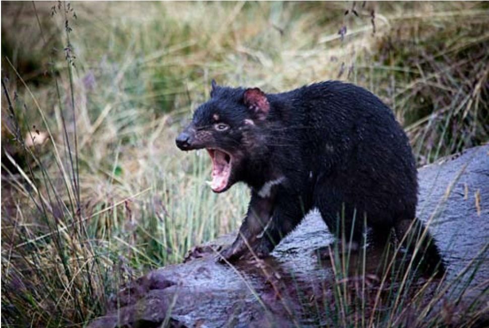
Cradle Mountain Devil by Susan Buchanan