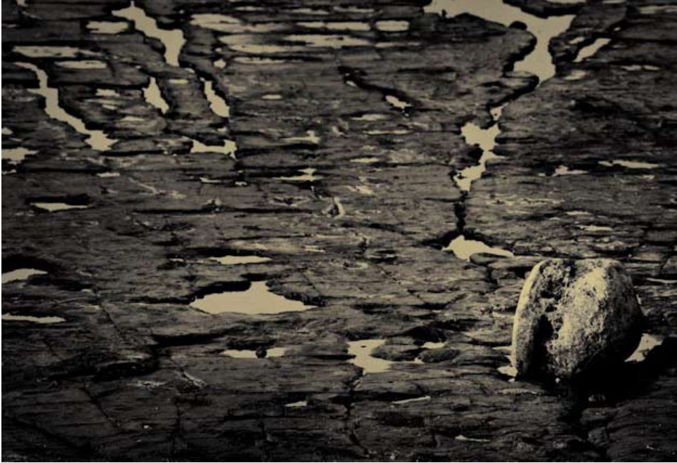
Culburra Beach by Susan Buchanan