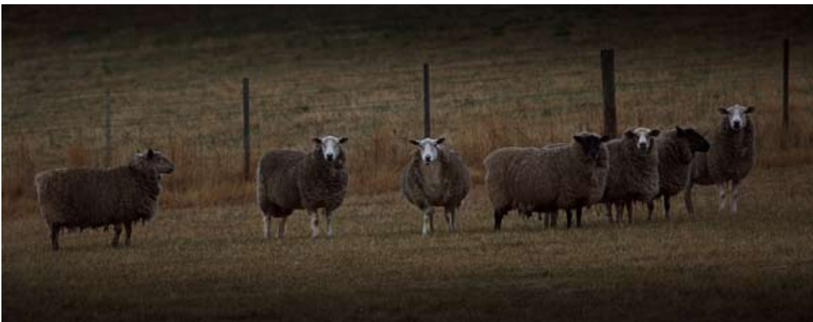
Black faced sheep; Topiary Town; Sheffield Murals

Tempting as Paradise was, the lure of Cradle Mountain proved too much. A word of warning: never rely solely on your GPS. I had experienced this in the USA when the GPS had me travelling along uninhabited roads when a 4-lane highway was only a few miles away. The unforgettable encounter with a dead skunk in the middle of the road may have made the detour worthwhile but really the jury is still out on that one! We were forewarned and duelled with the GPS over the mountain roads. The map won. The cold-climate rain forest gave way to more alpine vegetation and we entered the Cradle Mountain National Park. And it wasn't anywhere near the end of our first day..... Susan