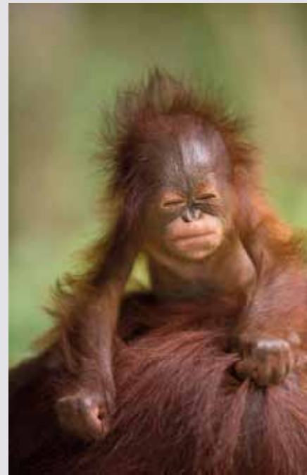
Borneo Baby. Wildlife Photographer of the Year 2009.